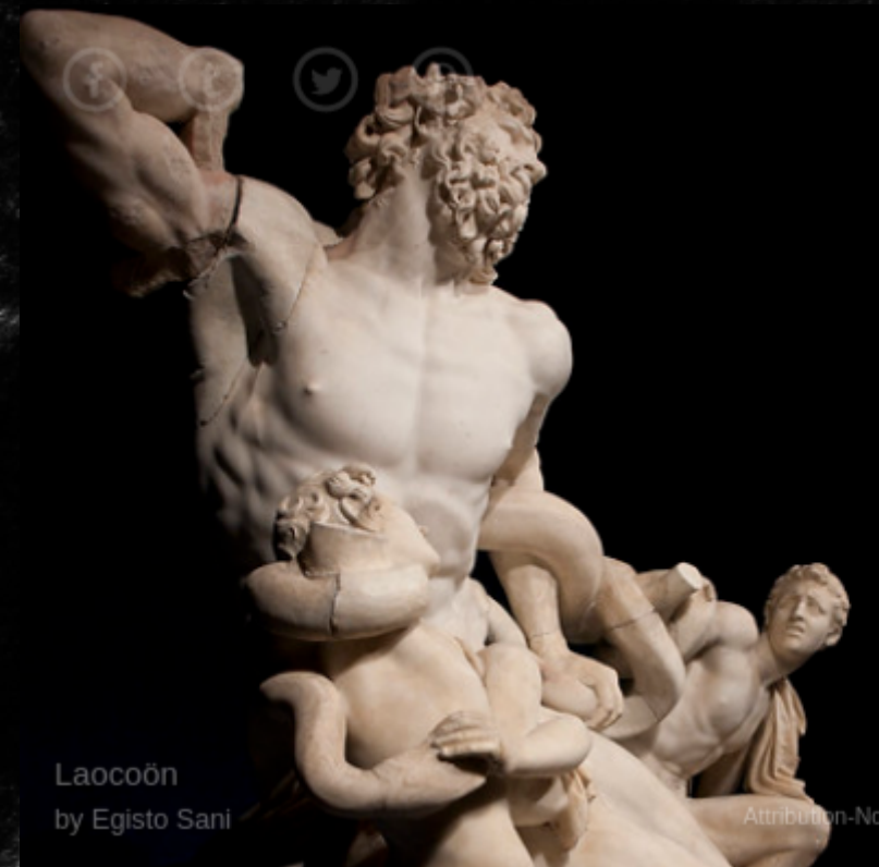
Laocoön by Egisto Sani