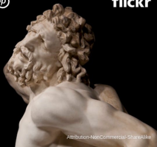
Laocoön by Egisto Sani